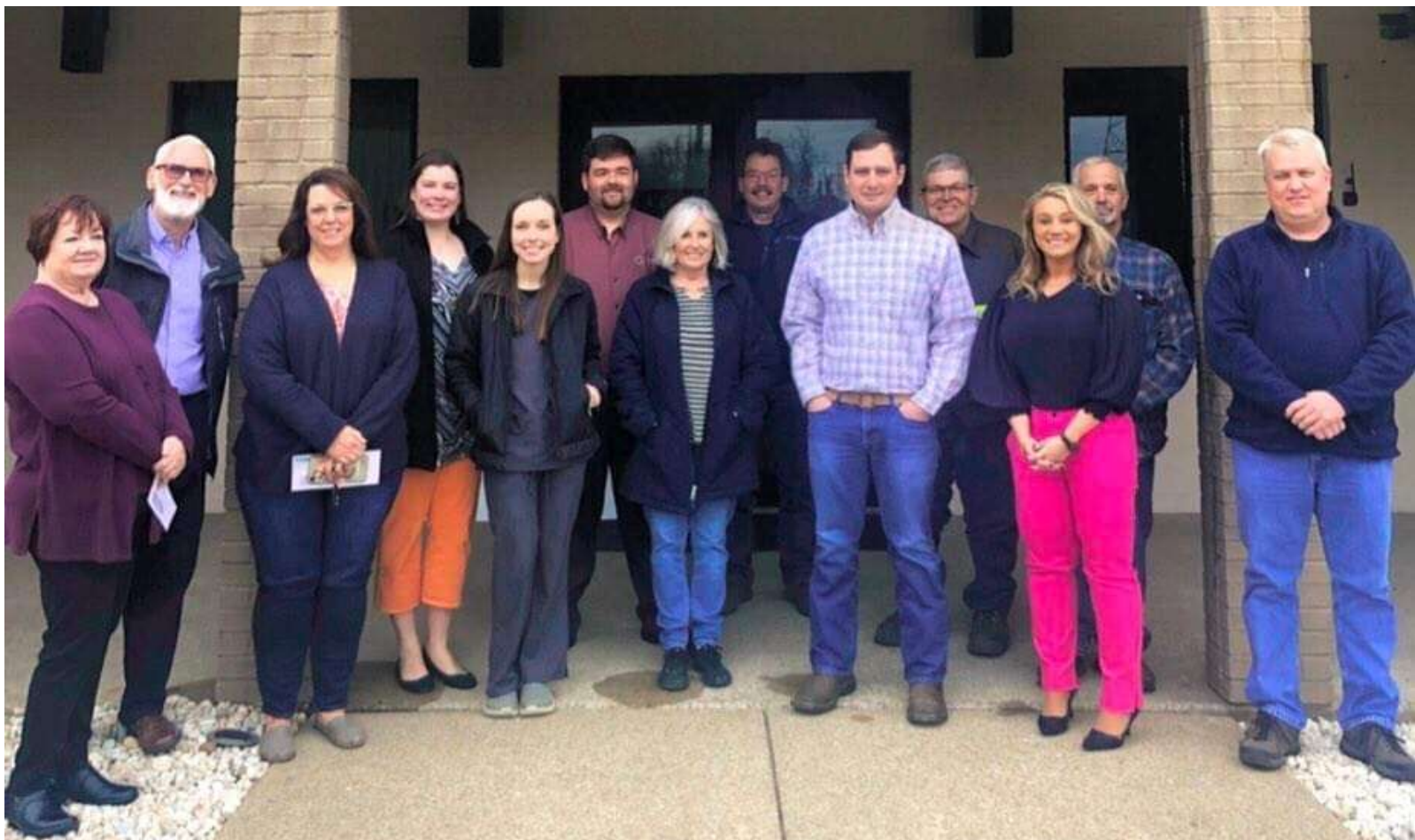
Pictured: Representaives from each of the 3 organizations & some of our team.