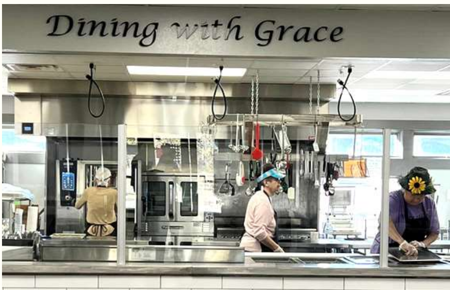
← Marcella's Kitchen workers prepping for their lunch crowd