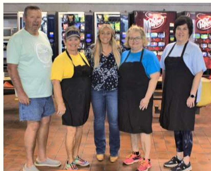
Safety Luncheon in May catered by Calvert Cafe